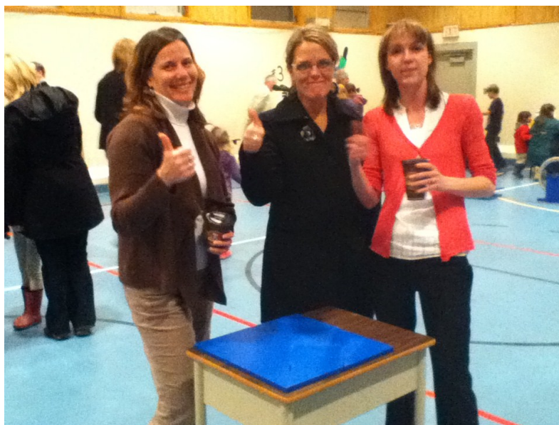
It took all 3 of them...but the tangram puzzle was conquered!